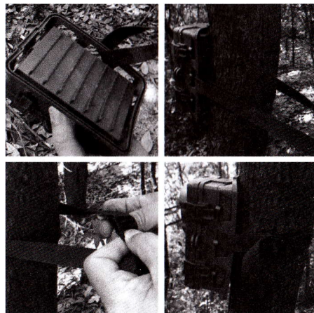
Fix camera with strap