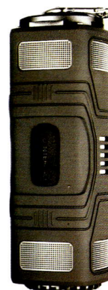
THUNDER Bluetooth® Speaker