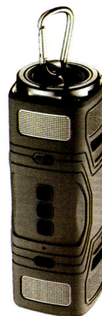
THUNDER Bluetooth® Speaker