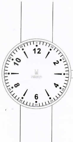
inWatch Color User guide