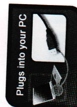
Plugs into your PC