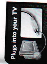
Plugs into your TV