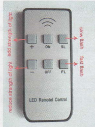
Remote A for single-color Candle