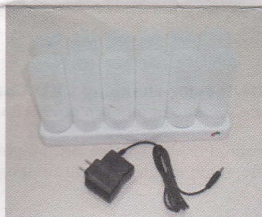
( ) Set of 12 without Remote