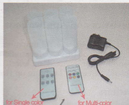
A( ) B(✓) Set of 6 with Remote