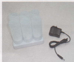
( ) Set of 6 without Remote