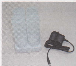
( ) Set of 4 without Remote

LED Candles, Frosted Holders, 1*Charging Base, 1* AC Adaptor, 1* Manual The Quantity of Led Candle and Frosted Holder up to what you choice. The details listed below,