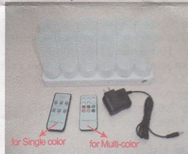
A( ) B( ) Set of 12 with Remote