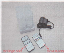
A( ) B( ) Set of 4 with Remote